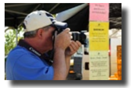
Jim sees something interesting